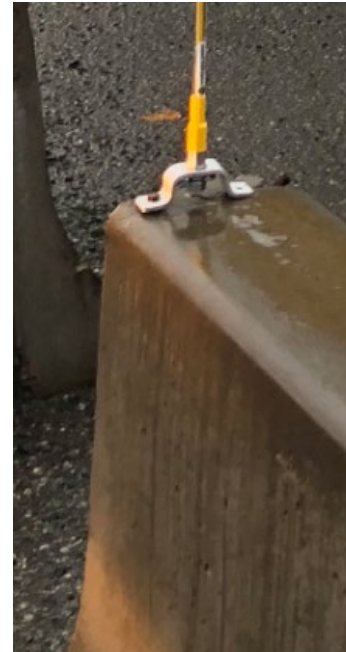
Aluminum Mounting Bracket